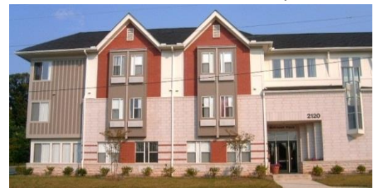
McCreesh Place, 2120 N. Davidson St. Charlotte, NC 28205

Visit our Website: www.supportivehousingcommunities.org